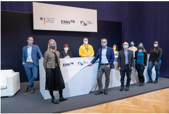
EMN Germany Presidency Conference

In late 2020, the EMN also jointly organised with OECD a series of webinars on the impact of COVID-19 on migration and asylum, as well as a series of roundtables covering relevant topics such as sector-based labour migration policies and sustainable migration.